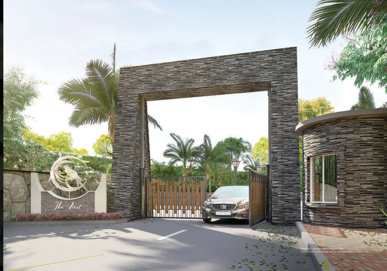
Image for representative purpose only. Trees shown in the image are for illustrative purpose only.

⇒ Experience ⇒ A RICH SENSE OF PRISTINE TRANQUILITY