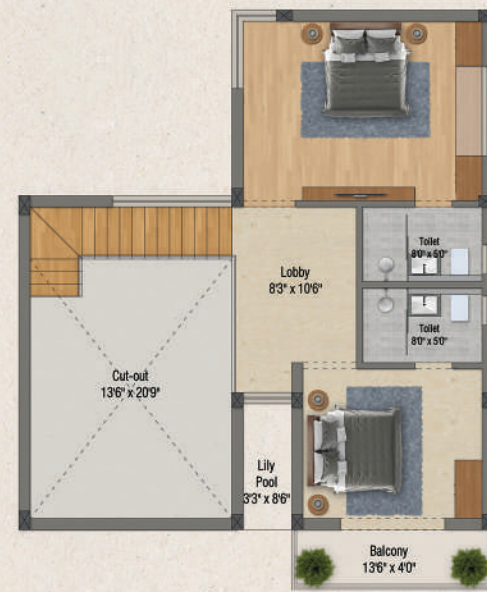
⇒ 1st floor plan ⇒