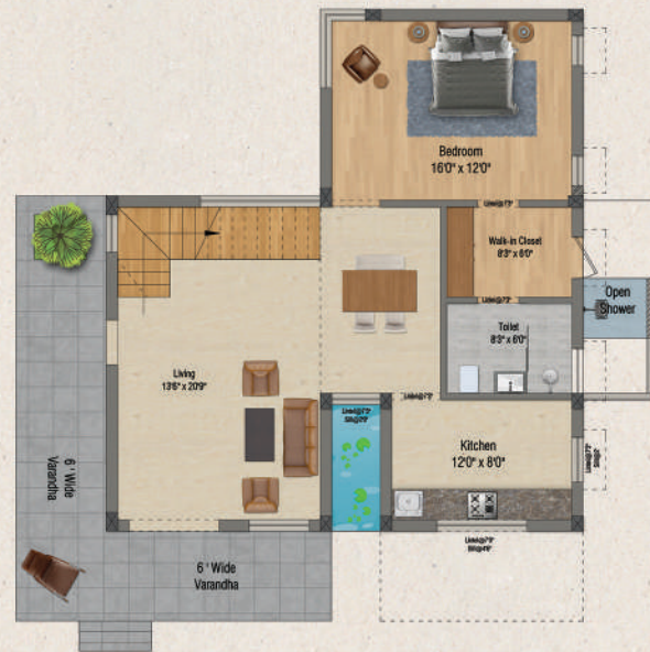
⇒ Ground floor plan ⇒