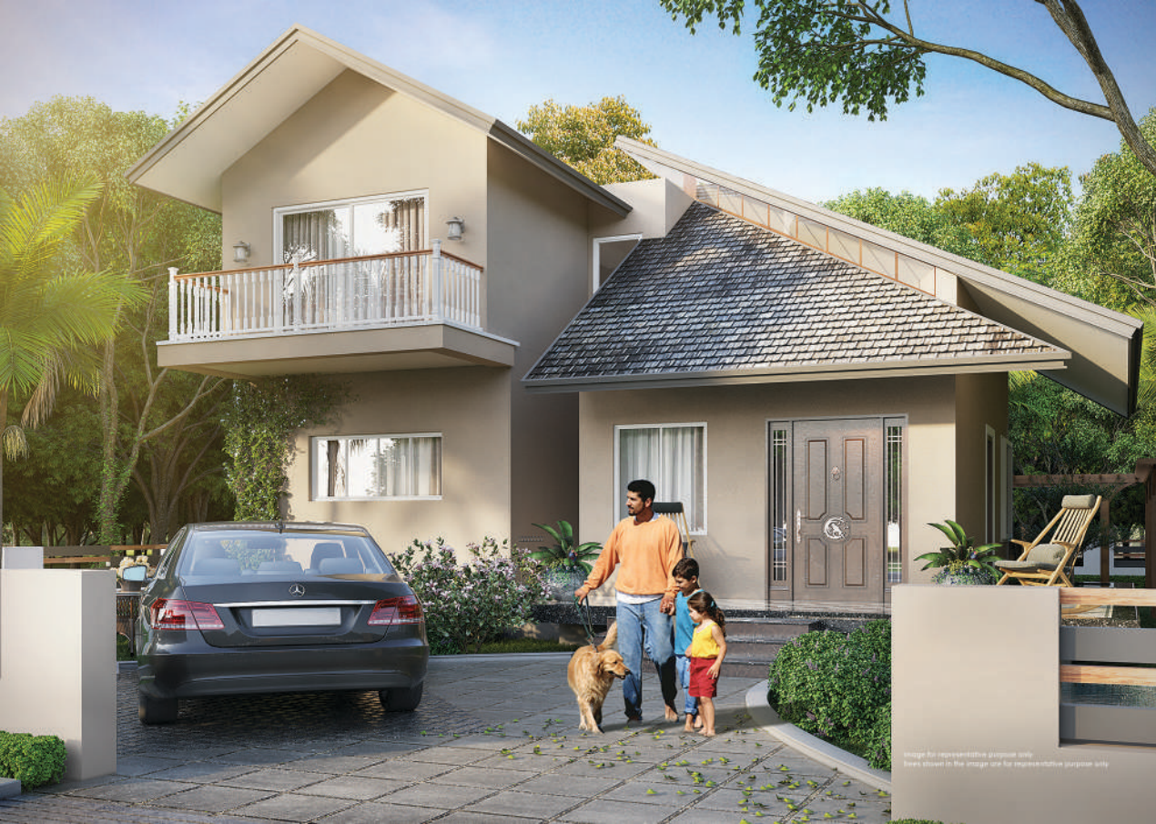
Image for representative purpose only Items shown in the image are for representative purpose only