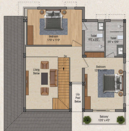
⇒ 1st floor (option-1) ⇒