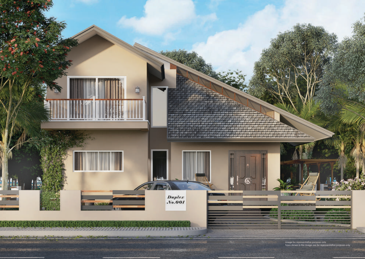
Image for representative purpose only Trees shown in the image are for representative purpose only