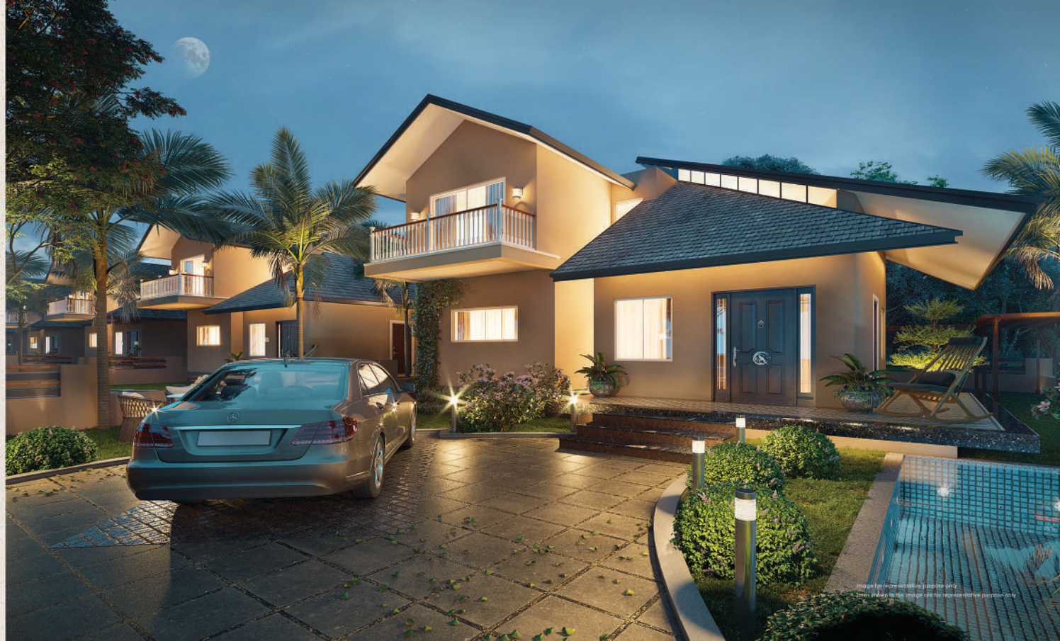
Image for recreational purpose only. Colors subject to the image call for representative purposes only.

Where its wishes are fulfilled. Breathtaking vistas in sublime comfort, the grandeur of stunning living spaces, and tranquility at your convenience when you have a wide range of choices for leisure.