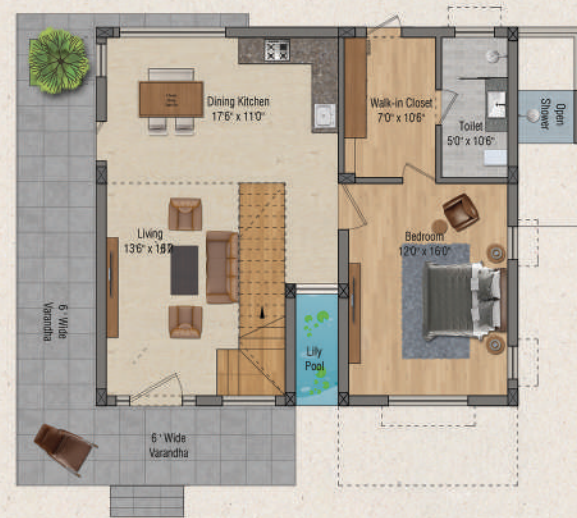
⇒ Ground floor plan ⇒