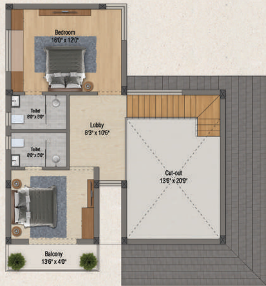
⇒ 1st floor plan ⇒