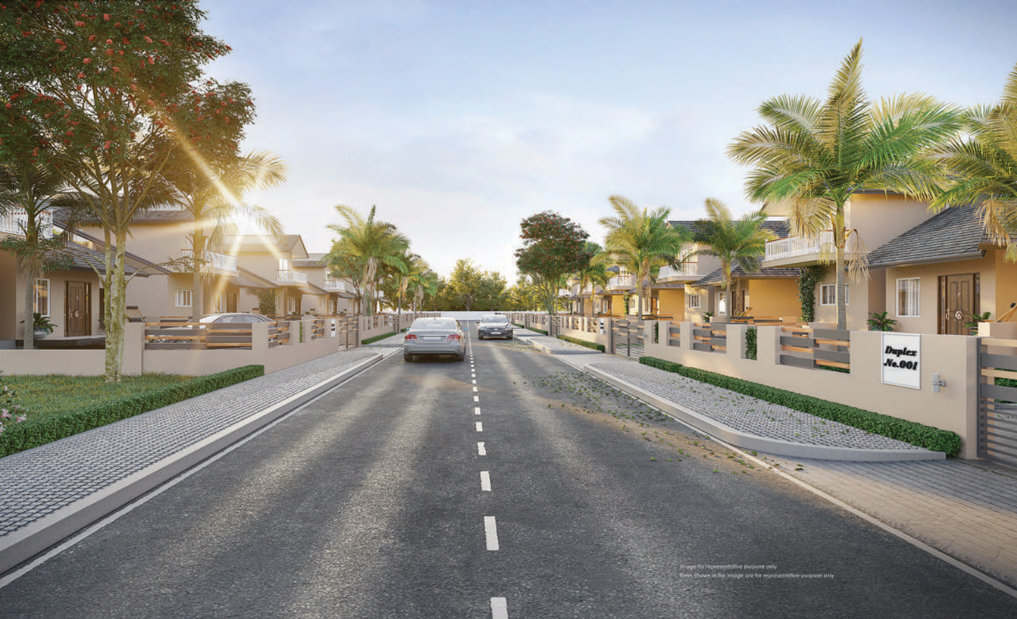
Image for representative purpose only Views shown in the image are for representative purpose only