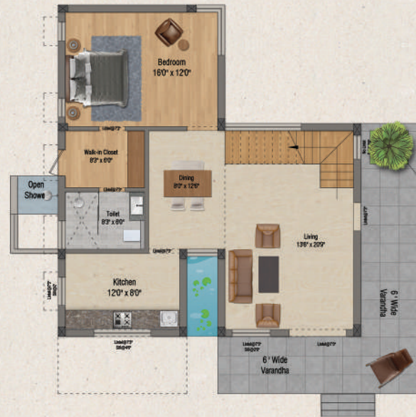
⇒ Ground floor plan ⇒